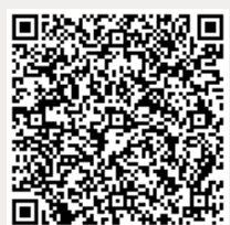
Scan QR Code

Huttons The Agency of Choice Call for Viewing +65-86886565