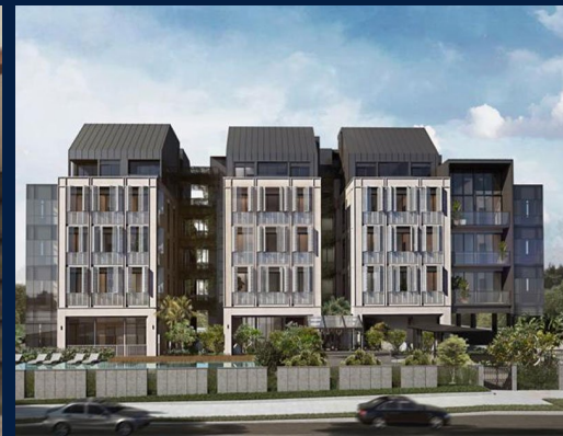
4 - Bedroom

TYPE 4B / 4B' / 4BG 4 BEDROOM + UTILITY + YARD #01-08 (TYPE 4BG) #02-08, #03-08 (TYPE 4B) #04-08 (TYPE 4B) 125 sq m / 1346 sq ft