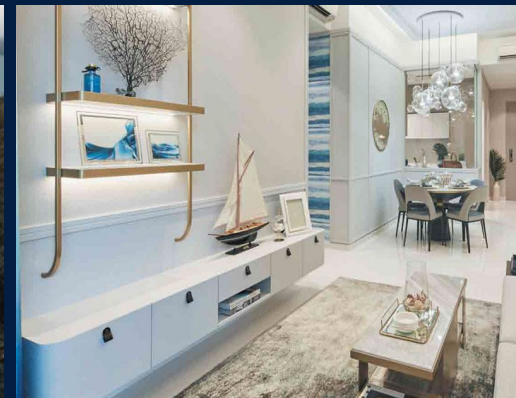
2 - Bedroom