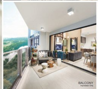
BALCONY Impression Only